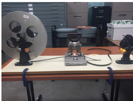
Image 1. Film Processing Station

The film processing station [pictured left] shows the winder, a dummy winder, a split reel, and splicer which was used. Both winders are screwed down to the board and the board is clamped using the blue clamps shown. Without the clamps, the board moved while winding the film which made the film wind unevenly. This is how the film was transferred from reels to cores.